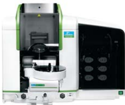
Figure 1. PinAAcle 900T atomic absorption spectrometer with AS 900 furnace autosampler.

A PerkinElmer® PinAAcle 900T flame and longitudinal Zeeman atomic absorption spectrometer was used for all measurements. Samples were automatically pipetted into standard transversely heated graphite atomizer (THGA) tubes (Part No. B0504033) using an AS 900 autosampler. PerkinElmer Lumina™ single-element hollow cathode lamps (HCLs) were used as the light source for lead (Part No. N3050157), cadmium (Part No. N3050115), and thallium (Part No. N3050183); while single-element electrodeless discharge lamps (EDLs) were used for arsenic (Part No. N3050605) and selenium (Part No. N3050672).